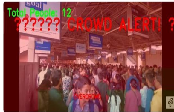
Fig 4 Dashboard Alert System