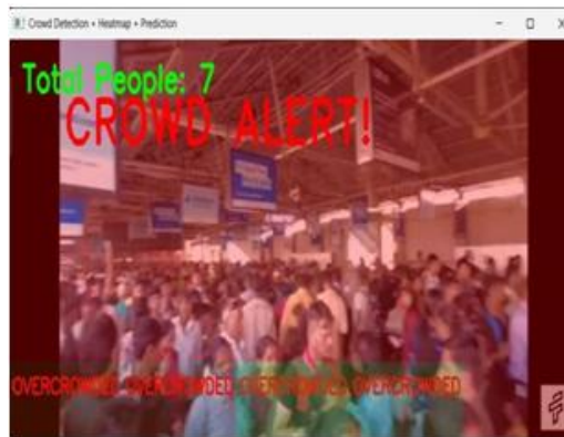
Fig 3 Crowd Alert Warning