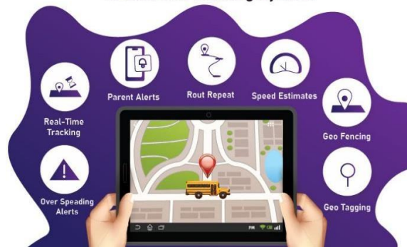
Figure 3: Real-Time Bus Tracking and Scheduling System using IoT [7]