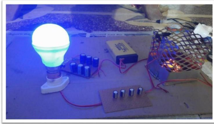
Figure 3: Project Implementation