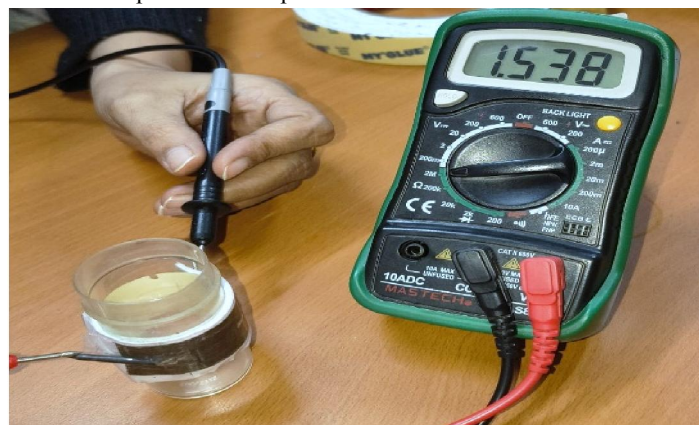
Fig. 3. Type A Graphite track rolled on 3cm Diameter Jar(pencil lead act as electrode)

Figure 2: Illustrates the sensor positioned flat on a rigid surface, representing the baseline resistance condition. Under this unstressed state, the multi-meter records the minimum resistance value, as the graphite flakes maintain optimal inter-particle contact and uniform conduction pathways. The absence of mechanical deformation ensures stable electrical behaviour of the sensor. This baseline resistance serves as a critical reference for quantifying relative resistance variations induced by subsequent bending or applied pressure. Accurate baseline characterization is essential for reliable evaluation of the sensor's piezoresistive performance.