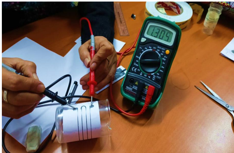
Fig. 1. Type B Rolled on Jar of diameter 3cm

The piezoresistive behaviour of the pencil-drawn graphite-on-paper sensor was systematically evaluated under varying mechanical stimuli. Electrical resistance variations were recorded using a calibrated digital multi-meter while subjecting the sensor to controlled bending and applied pressure. These measurements enabled assessment of the sensor's sensitivity and repeatability under mechanical deformation. The experimental results demonstrate a clear correlation between mechanical loading and resistance change. Quantitative data are summarized, and representative experimental setups are visually documented. Corresponding images are provided to illustrate the testing conditions and sensor response.