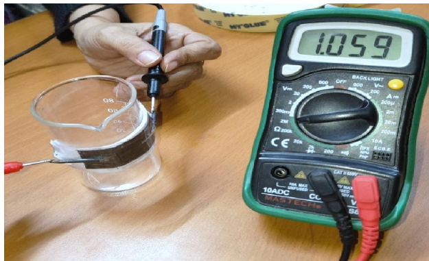
Fig. 4. Type A Rolled on 4.7cm Jar

Figure 4: Illustrates the sensor wrapped around a 4.7 cm diameter mandrel, representing a mild bending strain condition. The resistance is elevated compared to the flat state but remains lower than that for the 3 cm diameter mandrel. This intermediate resistance increase confirms that bending-induced strain and the corresponding piezoresistive response are strongly dependent on curvature radius, consistent with previous reports on graphite and carbon nanomaterial sensors [2], [4].