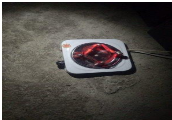
Figure 3: Solar Induction Cooker