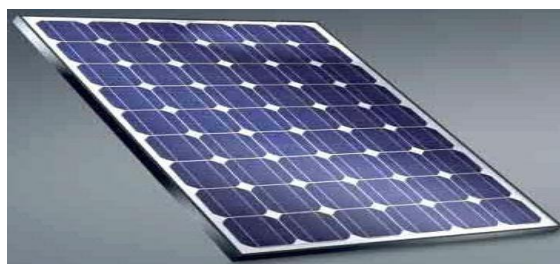
Figure 2: Solar Panel

Solar panel converts the sunlight into electricity, sunlight was collect either directly by using photovoltaic or indirectly using concentrated of solar energy. A solar cell works on the principle of photo-voltaic principle, the photo-voltaic solar energy conversion is one of the most attractive non-conventional energy sources of proven reliability from the micro to the Megawatt level.