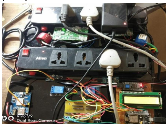
Figure 4.1: Experimental setup

In this paper we are dealing with two types of power theft. If any power theft is detected then a message will be sent to the KEB and consumer through GSM module. A registered SIM number is provided in the GSM module. The figure 4.1 shows the experimental set up of the proposed system