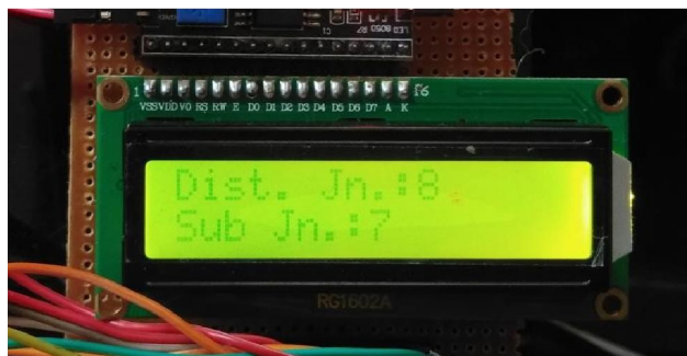
Figure 4.2: Distribution and sub junction difference unit display

The fig 4.2 showcase the energy consumed by distribution and sub junction and compares the power consumed by each junction.