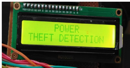
Figure 4.3: Power theft detection message display(LCD)

When the energy consumption is more than the threshold value the power will get cut-off using relay.