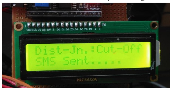
Figure 4.4: Automatic power cut-off message display

When the energy consumption is more than the threshold value the power will get cut-off using relay.