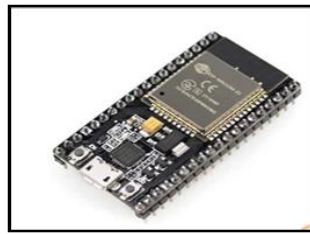
Fig. ESP 32

ESP32 acts as the central controller that connects the software system with hardware components. It receives signals from the decision module and controls the gate mechanism.