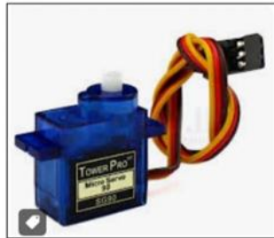
Fig. Servo Motor

The servo motor is used to control the opening and closing of the gate. It is activated by the ESP32 when an authorized person is detected.