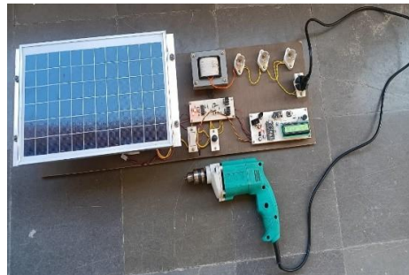
Fig05: Prototype turned off automatically due to low voltage