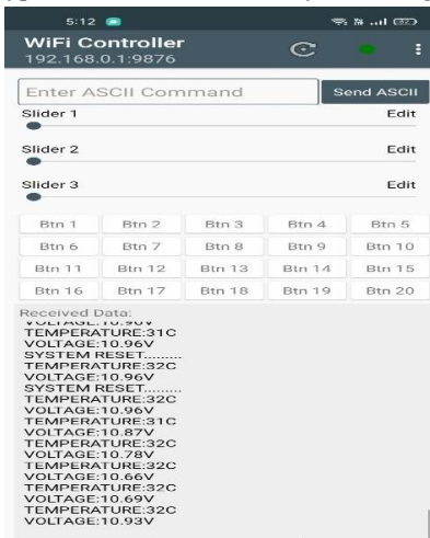
Fig07: Output shown in the mobile via wifi showing temperature and voltage