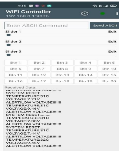
Fig08: Output shown in the mobile via wifi showing temperature and low voltage alert