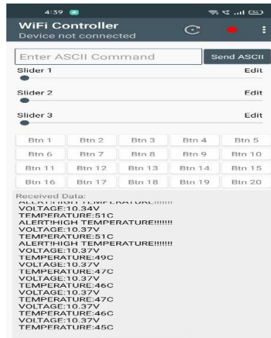
Fig09: Output shown in the mobile via wifi showing high temperature alert and voltage