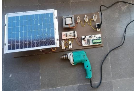
Fig06: Prototype turned off automatically due to high temperature