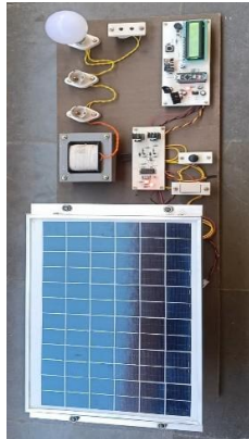
Fig04: Prototype displaying voltage and temperature