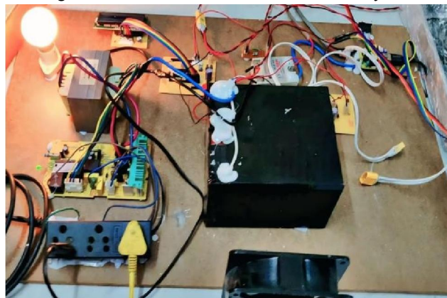
Fig.3. Control and Power Generation Circuit Setup with PIC Microcontroller and Load Output.