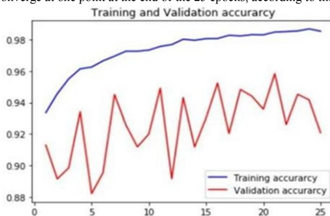
Figure 4: Plot of Training and Validation Accuracy

The following graphs may be seen after compiling our model and training it on train data with an epoch value of 25, then plotting the training and validation accuracy and the training and validation loss. The accuracy and loss of the training and validation datasets tend to converge at one point at the end of the 25 epochs, according to these graphs.