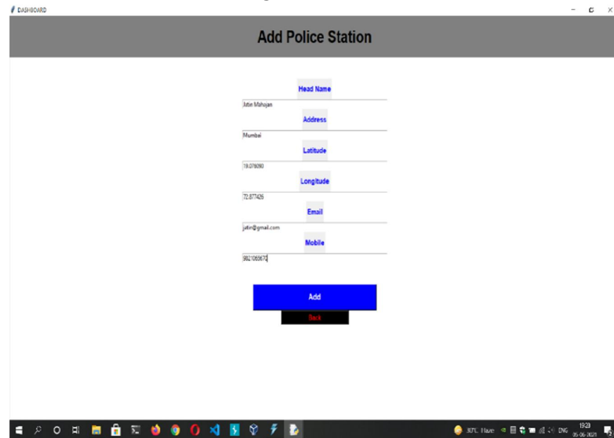
Figure: Add Police Station