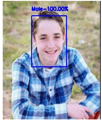
Figure 2: Result Image of camera input

• If the system detects the person in the picture and classifies the person as male then it displays the gender as male along with accuracy and the box which is highlighted around the captured face will be displayed in blue color.