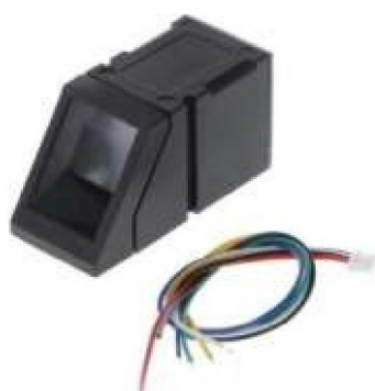
Figure 2: Fingerprint module