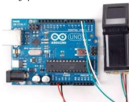
Figure 3: Circuit diagram of the proposed system