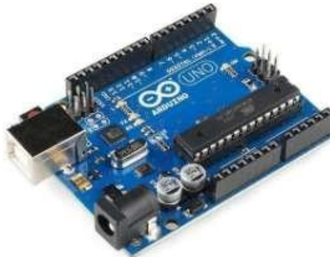
Figure 1: Arduino Uno R3

Arduino UNO is the most used board in the family of Arduino boards (Fig.1). In this research Arduino board function as main software. It is used for many researches in the field of electronic. This board is mainly connected to fingerprint module.