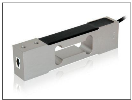
Figure 1: Load Sensor

A load cell is a transducer that actions power and results from this power as an electrical sign. The heap cells are utilized since it gives precise weight. A strain check is utilized in the vast majority of the heap cells for exact estimation. The driving voltage in the event that the heap is around 5 to 10V. This is utilized to gauge the heaviness of the chamber. The precision rate is under 0.1% of the full scale.