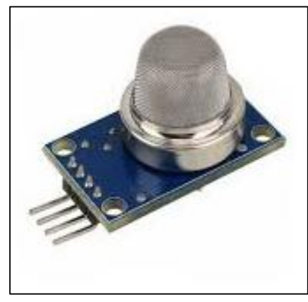
Figure 2: Gas Sensor

The Gas sensor (MQ-6) module is valuable for gas spillage location. The responsiveness can be changed by the potentiometer. The touchy material of the MQ-6 gasses detecting component is SnO2, with a lower actual peculiarity in clean air. The actual peculiarity of the detecting component is high once the combustible gas is recognized. The obstruction of the sensor is changed when the vaporous component interacts with the sensor. This change causes the adjustment of voltage. This voltage change can be perused in the microcontroller. There are different awareness values for the different vaporous components.