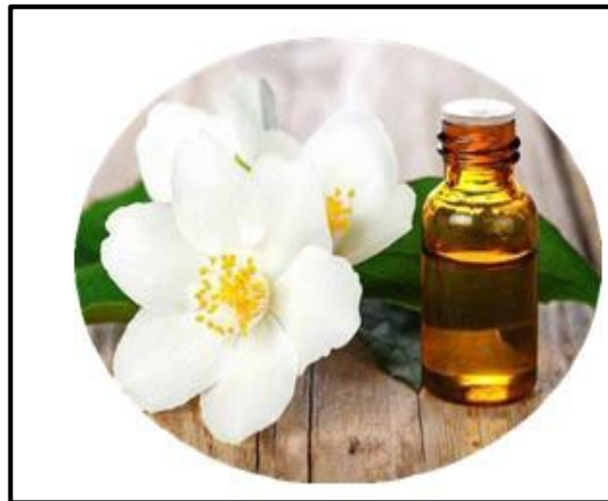
Figure1. Hibiscus Rosasinesis