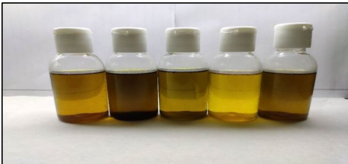
Figure 7. Effect of polyherbal hair oil 1- on DPPH Scavenging Activity