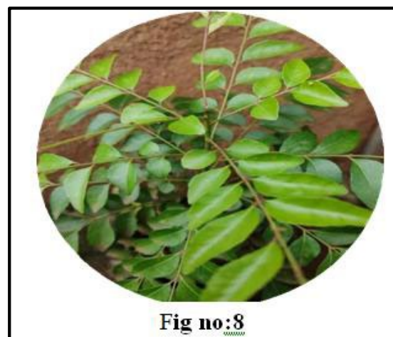
Figure 2. Curry plant