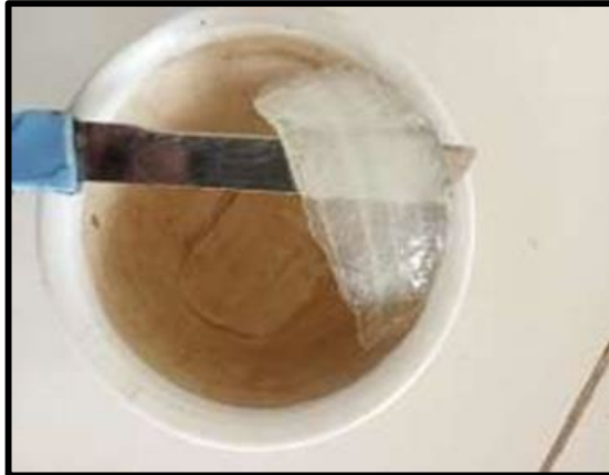
6. Placing the Gel into Mortar to homogenize it