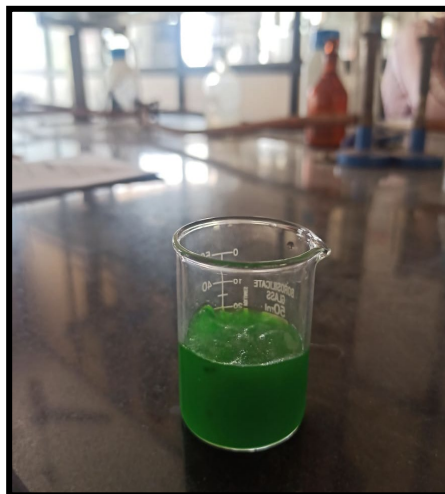
Prepared Aloe Vera Gel