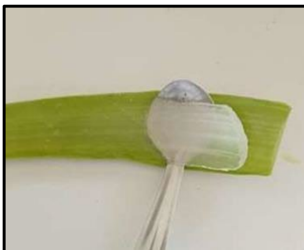
5. Scooping the Gel