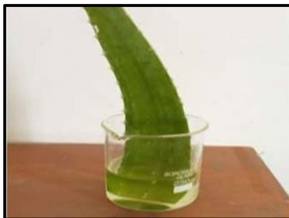
3. Leaf under Cold water