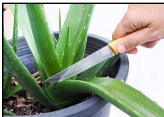
1. Cut off the Aloe-Vera leaves