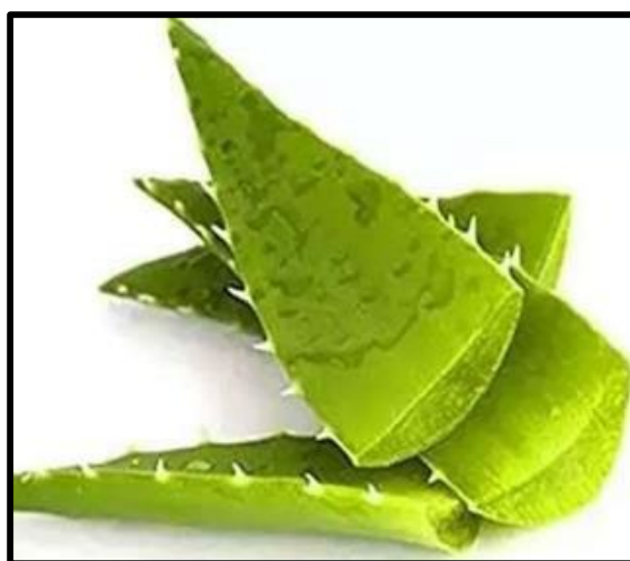
2. Aloe-Vera Leaves