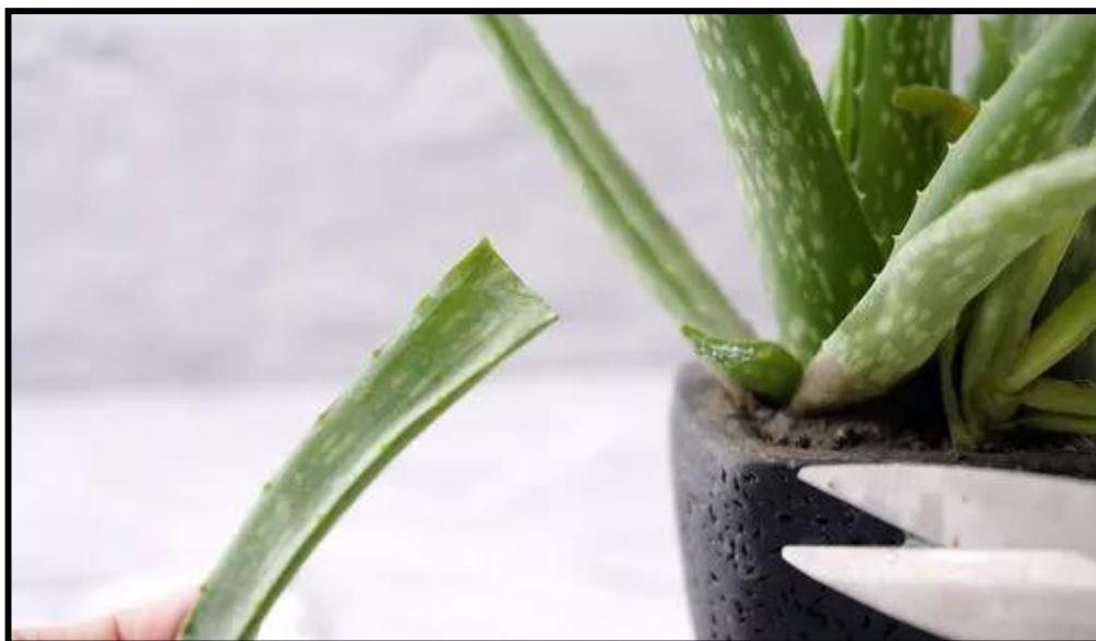
Fig. Aloe vera plant leaves

“Alloeh” meaning “shining bitter substance,” while “vera” in Latin means “true.” 2000 years ago, the Greek scientists regarded Aloe vera as the universal panacea. The Egyptians called Aloe “the plant of immortality.” Today, the Aloe vera plant has been used for various purposes in dermatology.