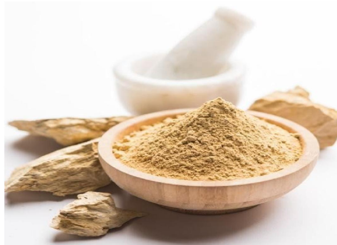
Fig. 6: Multani mitti

Multani mitti helps skin in different ways like minimise pore sizes, removing blackheads and whiteheads, cleansing skin, improving blood circulation, reducing acne and gives a glowing effect to a skin as they contain healthy nutrients. Multani mitti is rich magnesium chloride.