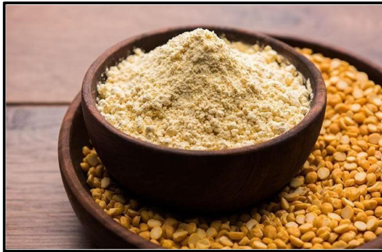
Fig. 6: Gram flour

Gram flour is good for acne-prone skin and can help to lighten any acne scars. It can also be applied all over the body to remove dark spots. It has been used as a base in preparation of herbal scrub.