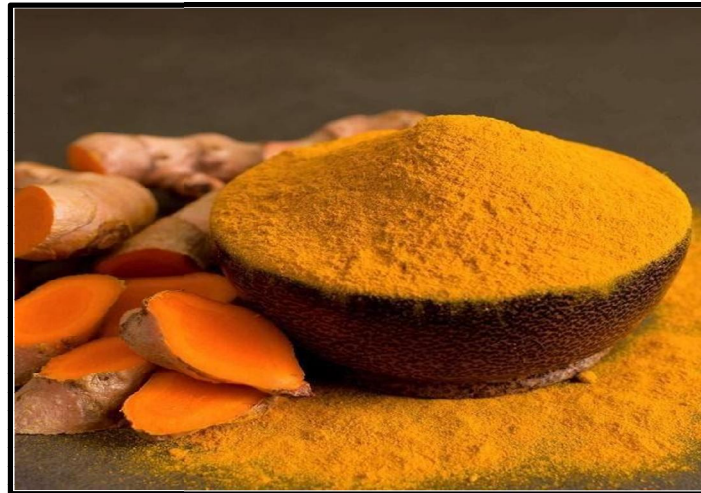
Fig. 4: Turmeric

Turmeric is mainly used to rejuvenate the skin. It delays the signs of aging like wrinkles and also possesses other properties like antibacterial, antiseptic and anti-inflammatory. It is effective in treatment of acne due to its antiseptic and antibacterial properties that fight pimples and provide a glow to your skin. It also reduces the oil secretion by the sebaceous glands. Turmeric widely used condiment and colouring agent. The yellow root Turmeric shows anti-inflammatory property.