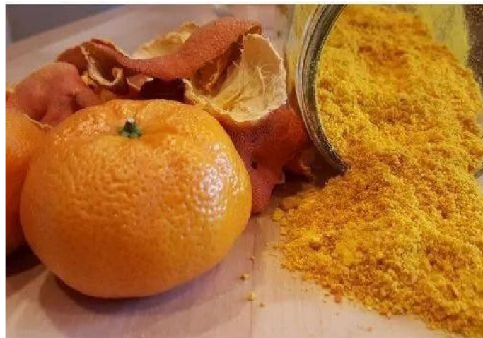
Fig. 5: Orange peels

Orange is a citrus fruit which contains different nutritional source like vitamin C. It also contain calcium, potassium and magnesium. It prevents the skin from free radical damage, skin hydration and oxidative stress. Also it has instant glow property, prevent acne, wrinkles and aging.