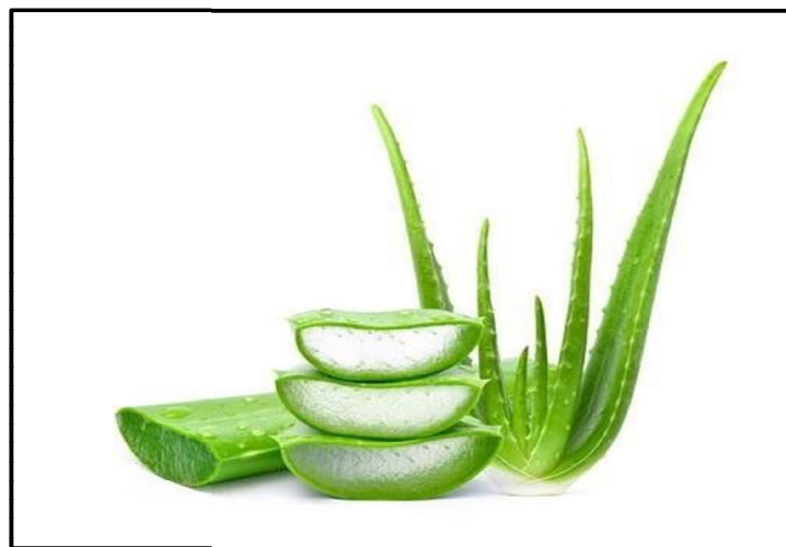
Fig. 3: Aloe vera.

The word aloe Vera means "aloe meaning shining bitter substance while "vera" means true. Aloe Vera contains vitamin A and C and it is also shows anti-inflammatory properties. Aloe Vera belongs to family "Liliaceae and commonly known as Ghritkumari. Aloe Vera used as moisturizing and softening agent on skin. The aloe gel gives cooling effect on skin it has role in rejuvenation of aging skin, Aloe Vera has been used for variety of medicinal purpose. Aloe Vera also be used as a moisturizer.