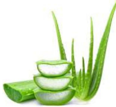
Fig.2.1 Aloe Vera

[bP6¼9ngs to Asphodelaceae (Liliaceae) family, and is a shrubby or arborescent, perennial, xerophytic, succulent, pea-green plant. It grows mainly in the dry regions of Africa, Asia, Europe and America