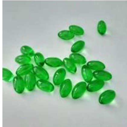
Fig.3.2 Vitamin E (Evion)

3.3. Bentonite: It is an absorbent swelling clay consisting mostly of montmorillonite. It usually forms from weathering of volcanic ash in seawater, which converts the volcanic glass present in the ash clay minerals.