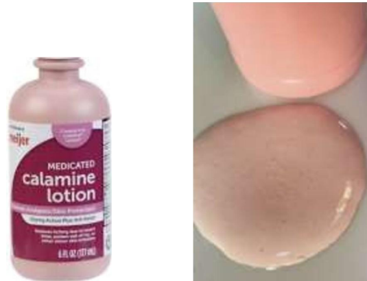
Fig.4.1 Calamine Lotion Fig.4.2 Semi-Solid Lotion of Calamine

Calamine lotion IP ..... 50 ml Label - Calamine lotion LP ..... 50ml