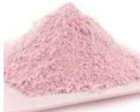
Fig.3.1 Calamine Powder

3. ICalamine Powder: Calamine powder is a composition of zinc oxide combined with some amounts offerric oxide. The presence of iron (in the form of ferric oxide) in Calamine powder.