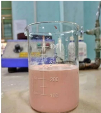
Fig. Physical appearance

Colour: Light greenish Odour: Characteristics Texture: Viscous liquid