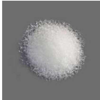
Fig.3.5 Sodium Citrate

3.6. Liquid Phenol: A colourless liquid when pure, otherwise pink or red. Combustible. Flash point 175°F. Must be heated before ignition may occur easily. Vapours are heavier than air. Corrosive to the skin but because of anaesthetic qualities will numb rather than burn. Upon contact, the skin may turn white. May be lethal by skin absorption. Do not react with water. Stable in normal transportation. Reactive with various chemicals and may be corrosive to lead, aluminium and its alloys, certain plastics, and rubber. The freezing point is about 105°F. Density 8.9 lb/gal. Used to make plastics, adhesives, and other chemicals.