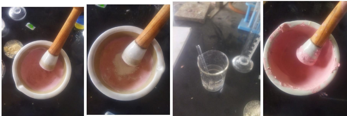
Fig.3.8 Mortar and Pestle