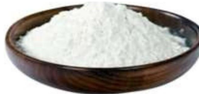
Fig.3.4 Zinc Oxide

3.4. Zinc Oxide: Zinc oxide is a zinc molecular entity. ChEBI. Zinc oxide is an inorganic compound used in several manufacturing processes. It can be found in rubbers, plastics, ceramics, glass, cement, lubricants, paints, ointments, adhesives, sealants, pigments, foods, batteries, ferrites, fire retardants, and first-aid tapes.