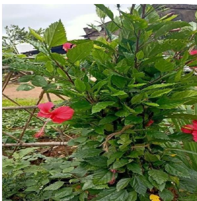
Fig.no.1 Hibiscus Rosasinesis

Biological source-dried leaves of hibiscus Rosa sinesis.