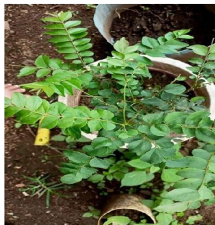
Fig.no.2 Curry Leaves