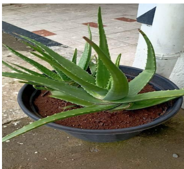
Fig.no.3 Aloe vera Biological

Source- Dried leaves of aloe barbadensis miller Family- Liliaceae