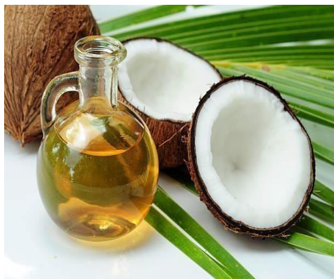
Fig.no.6 Coconut oil

Biological source- Oil is derived from dried fruits of Cocos nucifera .