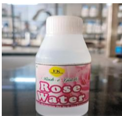
Fig.6: Rose water