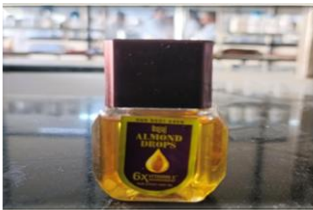
Fig.4: Almond oil