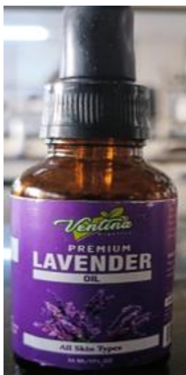
Fig.8. Lavender oil