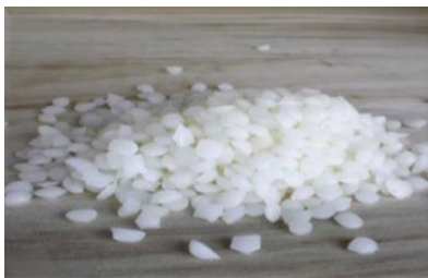
Fig.7: Beed wax