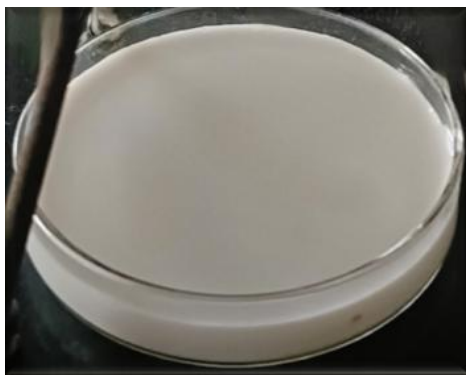
Fig.2: Coconut milk