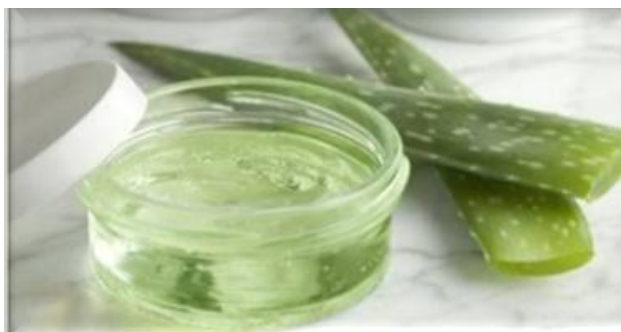
Fig. 1: Aloe vera gel