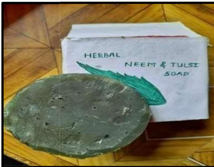
Fig :- Herbal Neem And Tulsi Soap