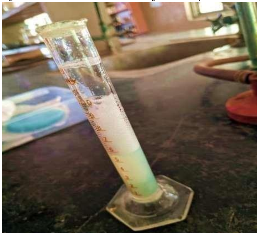
Fig : - Foam Height

0.5 g of sample of soap was dispersed in 5 ml distilled water. Then, transferred it into 10 ml measuring cylinder. Five-eight strokes were given and allowed to stand still and the foam height above the aqueous volume was measured.