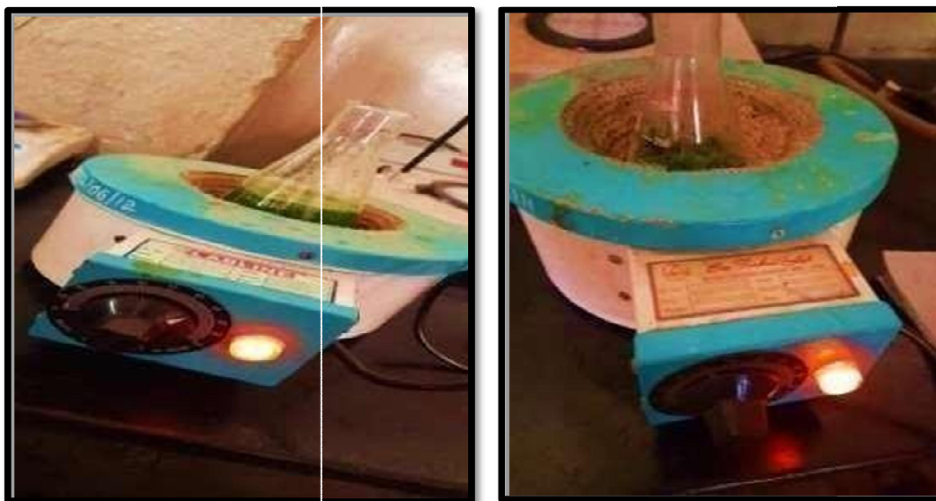
Fig– Extraction of Neem and Tulsi