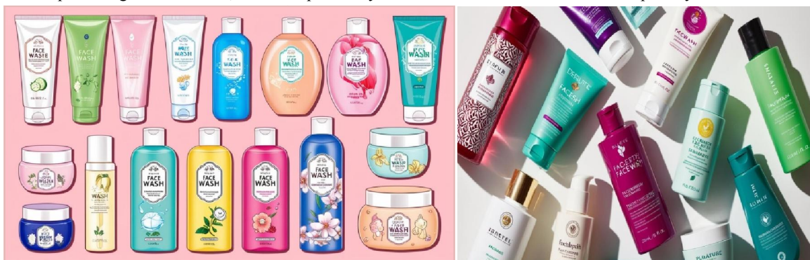
Fig. Different types of face wash

There are different types of face wash in the market according to skin type, flavor, and ingredients. But they all in the form of liquid and gel- based form, which is quiet risky to handle. Not known the sufficient quantity to use for face.