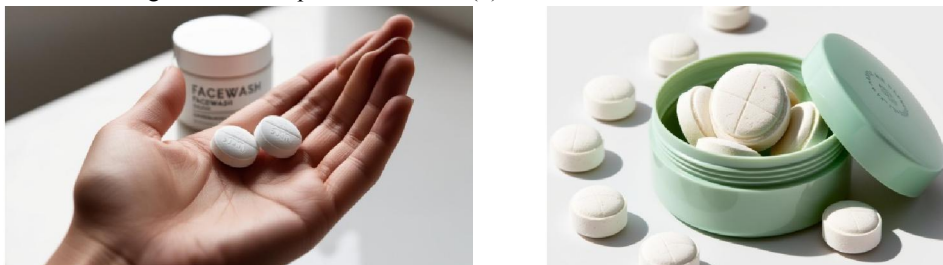
Fig. Facewash tablet

irritation, hardness, thickness, friability and foaming capacity etc. According to the results of this study, the prepared batch F6 creates outstanding foam and exquisite facewash. (6)