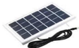
Fig.2 Solar Panel