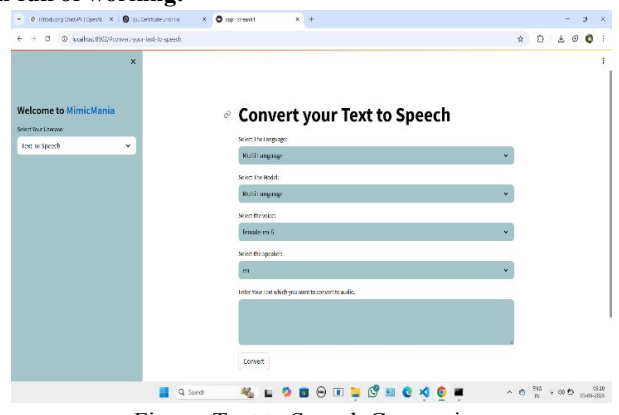
Figure: Text to Speech Conversion