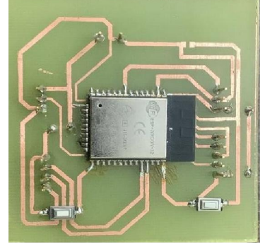
Fig. 2.2 Custom-Designed ESP32

Hardware Design and ESP32 Integration: Unlike conventional systems that use pre-assembled microcontroller modules, this project features a custom-designed PCB based on the ESP32 microcontroller, ensuring optimized hardware integration. The ESP32 was chosen for its built-in Wi-Fi and Bluetooth capabilities, low power consumption, and high processing efficiency, making it ideal for IoT-based real-time health monitoring applications. Fig 2.2 shows the custom designed ESP32 PCB, designed to accommodate multiple sensor connections, power management circuits, and communication interfaces, ensuring seamless data acquisition and transmission.