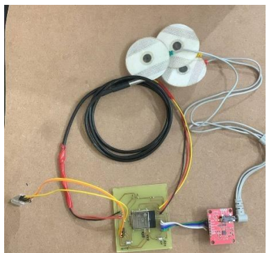
Fig. 3.2 Hardware

Fig 3.2 displays the hardware which is a custom-built health monitoring system designed for real-time tracking of vital signs.