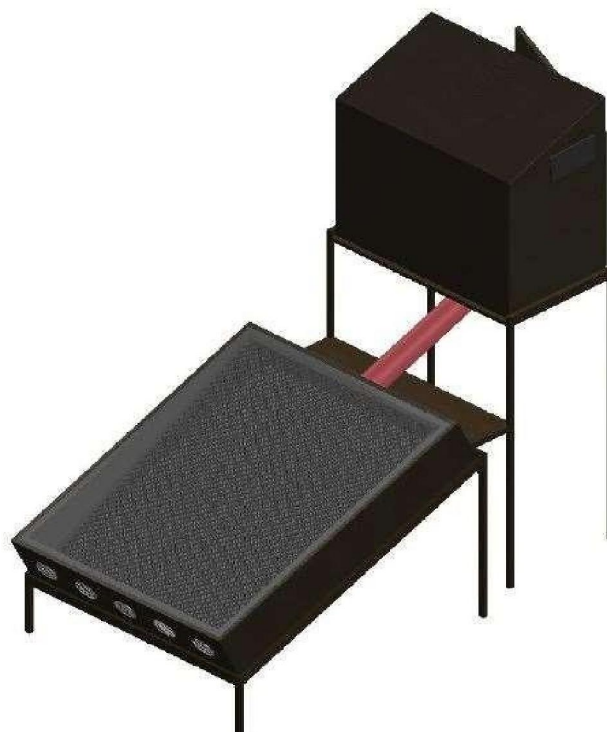
Figure 2- 3D Diagram