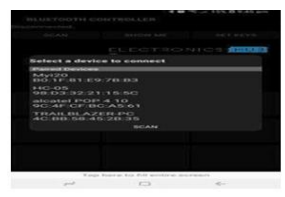
Figure 4: Alert Messages from Kit