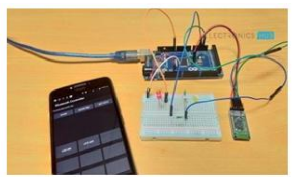
Figure 3: Mobile connected HC-05 Bluetooth Module