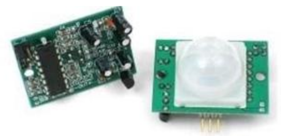
Figure: PIR Sensor

PIRs are essentially made of a pyroelectric sensor (shown below as the circular metal container with a rectangular crystal in the centre) that detects levels of infrared radiation. Everything emits some low-level radiation, and the higher the temperature, the more radiation is emitted. A motion detector's sensor is actually divided into two sections. The rationale for this is that we want to detect mobility (change) rather than average IR levels. The two sides are linked together in such a way that they cancel each other out The output will swing high or low if one part sees more or less IR radiation than the other.