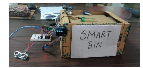
Figure 6.1 Output System