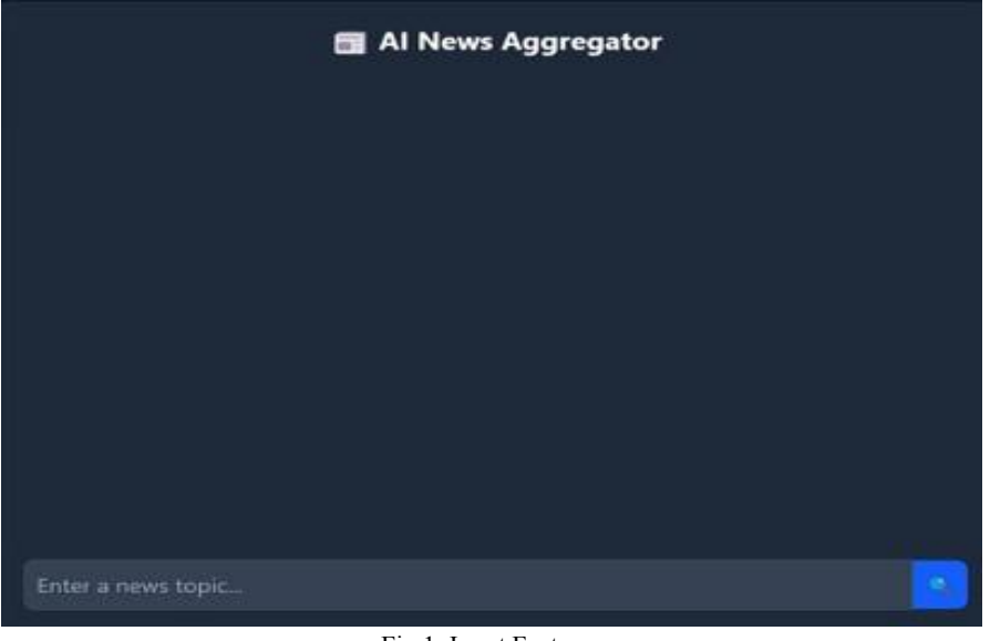
Fig 1: Input Features

The input process starts with a text input field on the React.js interface, where users can enter a news topic, as shown in the initial interface (refer to previous figures). Upon submission, the query is sent to the backend via a POST request to the /search endpoint, where it is logged in the MySQL database and processed using the Google Custom Search API, Cheerio.js for scraping, and Gemini AI for summarization. The frontend, styled with Tailwind CSS (bg-gray-700, border-gray-600) and enhanced with Framer Motion animations, provides visual feedback during processing, such as a "Fetching results..."message.This design ensures users remain engaged while the system retrieves and summarizes news content.