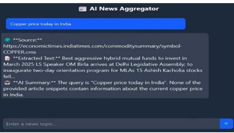
Fig 4: The AI News Aggregator summarized the relevant news

Step 01: View the source URL of the news article. The output displays the article's URL in a clickable link, marked with a emoji, providing the user with the original source for reference.