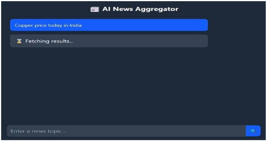
Fig 3: Fetching the new

The output shows the interface of an "AI News Aggregator" application. The interface features a dark-themed design with a central panel displaying the current topic being processed, which is "Copper price today in India," highlighted in blue. Below this, a "Fetching results..." message indicates that the application is retrieving information. At the bottom, there is a text input field with the placeholder "Enter a news topic..." and a blue button, suggesting users can input new topics to explore. The overall layout is clean and minimalistic, designed to provide a seamless user experience for accessing news updates.