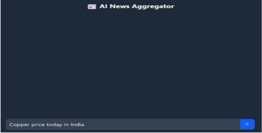
Fig 2: Query entered in the text input field

The design ensures a responsive layout that works seamlessly across various devices, maintaining a clean and readable interface. The output process begins after the backend completes processing the user's query, fetching an article via the Google Custom Search API, scraping content with Cheerio.js, and generating a summary using the Gemini AI API. The results are stored in the MySQL database and retrieved by the frontend through polling the /results/:queryId endpoint every 3 seconds (up to 5 attempts). The formatResponse function structures the output into three sections—source URL, extracted text, and AI summary—displayed in a gray bubble (bggray-700) with emojis for visual distinction, as shown in Figure 1. Framer Motion animations (initial={{ opacity: 0, y: 10 }}, animate={{ opacity: 1, y: 0 }}) ensure a smooth transition, enhancing the user experience.