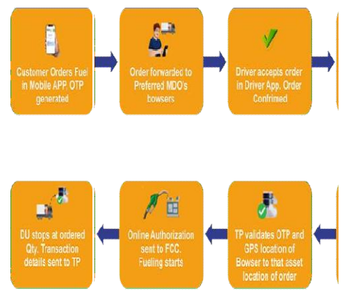
Fig . 1.1 System Diagram

Critical outcomes of an online fuel delivery system include providing support towards creating more efficient, highersatisfied customers and gaining market advantage. Therefore, results the system should generate are those expected from its usage, as has been through evidence-based and case study materials from the industry.Results entail the following: First of all, operational efficiency has improved remarkably. Route optimization algorithms are said to reduce delivery time by a substantial estimated 20-30%. This also cuts down on fuel and, therefore, operational costs. Subsequently, this goes on to increase profits. Fuel monitored in real-time through IoT-enabled devices automatically manages inventory. Hence, it can reduce stockouts up to about 40%. It will ensure constant supply with demand.Some of the metrics that would delineate how well a service business is performing include customer satisfaction. With a mobile application, the customer can order fuel anywhere and at any time; this can potentially rocket up retention rates up to as high as 25%.