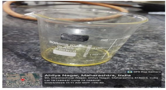
FIG 15: APPEARANCE TEST

Appearance test-In appearance test we determined the parameters such as color ,clarity, homogeity.