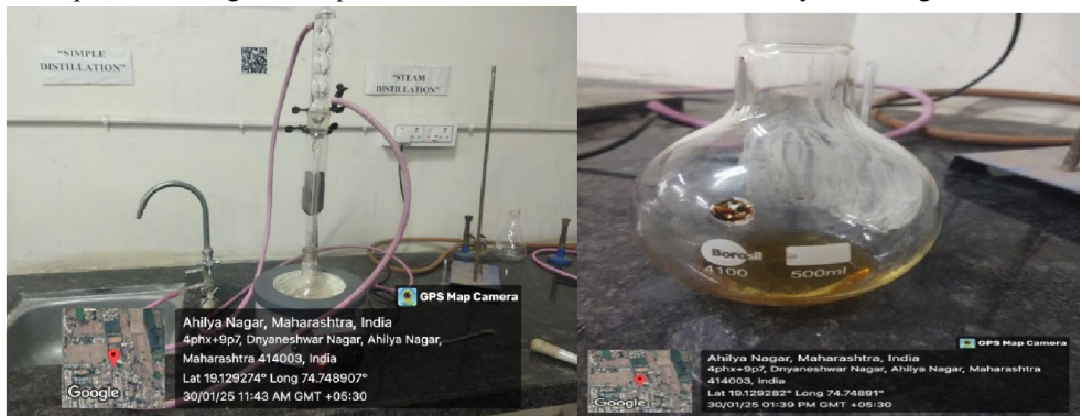
Fig 9: Extraction of clove oil by soxhlet apparatus

3. Collection and Purification: Collect the Extract: After the extraction, the solvent containing the clove oil is collected in a flask. Solvent Removal: The solvent is then evaporated, leaving behind the clove oil. Purification: The crude clove oil can be further purified through techniques like vacuum distillation to remove any remaining solvent and impurities