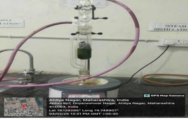
Fig11: Extraction of menthol by soxhlet apparatus