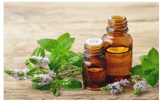
FIG 5-MENTHA HERB AND OIL (MENTHOL)