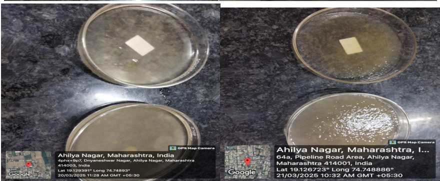
FIG16: TEST FOR MICROBIAL GROWTH