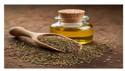
FIG 6-AJWAIN HERB AND THYMOL (AJWAIN OIL)