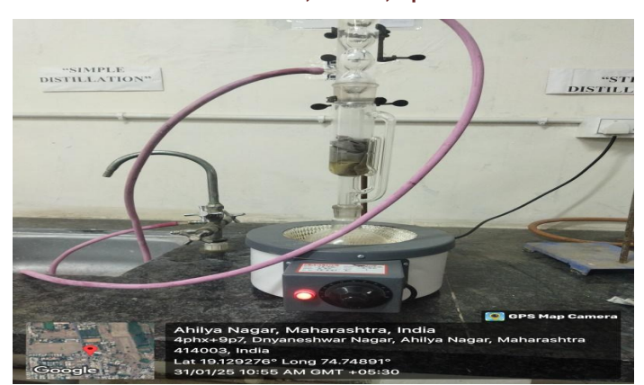
Fig10: Extraction of Thymol by soxhlet apparatus