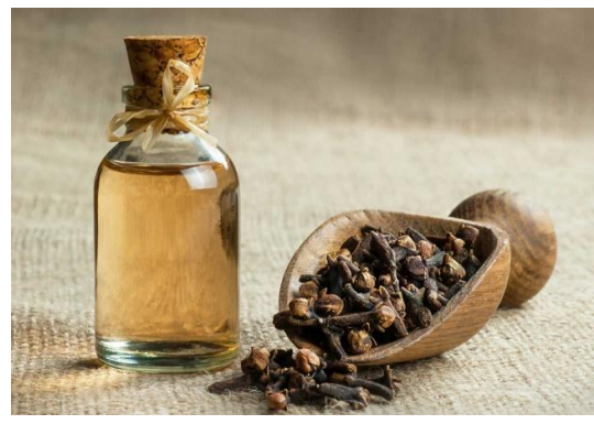
FIG 4-CLOVE OIL FROM CLOVE