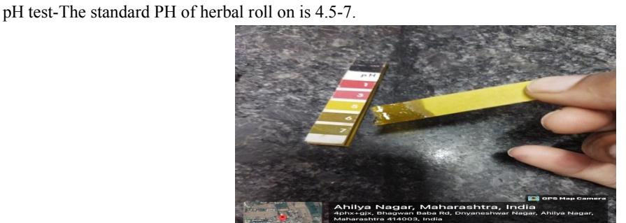
FIG14: PH TEST

The Herbal Feminine Roll On to Reduce Dysmenorrhea was prepared and evaluated. This roll on contains camphor oil, cloveoil, menthol oil, thymol, and as a foetida oil.