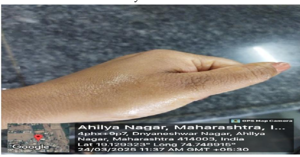
FIG 17: REMOVAL TEST

In this Batch F3 is not acceptable because it did not easily removed and shows the residue after washing.