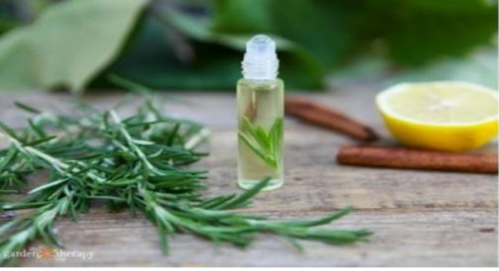
FIG. 3- HERBAL ROLL ON

A Roll-on is a type of liquid prepartion packed in a container with an applicator consisting of a revolving ball at the top of the dispenser. It conatins a mixture of volatile oils such as clove oil, camphor oil, thyme oil, menthol etc. These oils are commonly used to deal with stress, relieve pain, migraine, anti-inflammatory, deal with anxiety, relieve sinus tensions, etc. This topical ache reliever containing all-herbal components reasons a pleasant sensation beneficial to counteract the ache. Medictions which includes aspirin, ibuprofen and naproxen lessen prostaglandin manufacturing and accordingly lessen menstrual cramps. The mixture of hormonal delivery manage with anti-prostaglandin remedy may be very powerful in each stopping and treating menstrual cramps. Inspite of all these medications we prepare a herbal roll on oil for prevention of menstrual cramps which we named 5 Days Feminine Herbal Roll On.