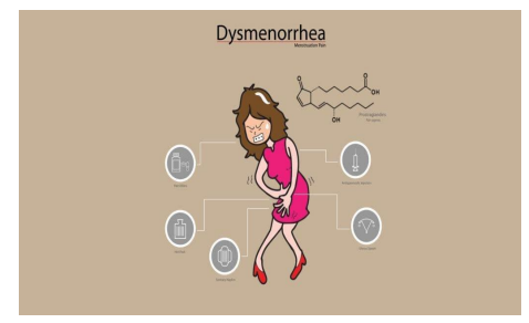
FIG.1-OCCURRENCE OF DYSMENORRHEA FIG.2DYSMENORRHEA