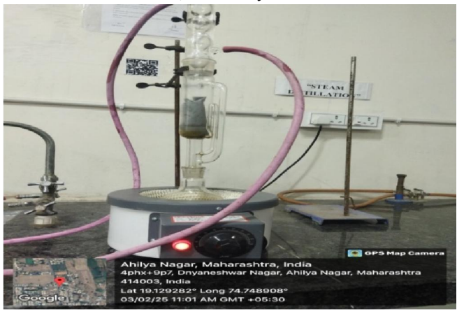
Fig12: Extraction of asafoetida oil by soxhlet apparatus