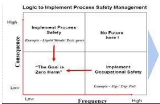
Fig. 2: How process safety is different from occupational safety [24]