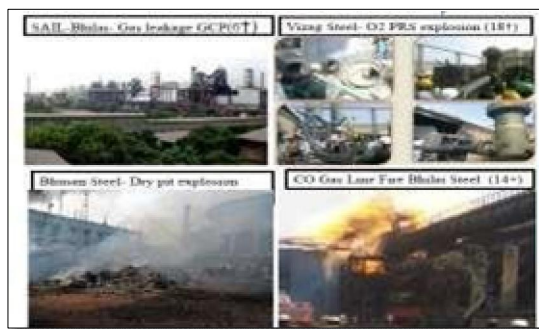
Fig. 1: Process Disasters at Indian Steel Industry [12]

The most important 3 characteristics of safety management system are effort, time and money. In order to achieve a zero accident rate an organization needs to provide these 3 basics. The very next principle of the safety management system is the involvement and commitment towards the assigned work. Since without involvement a work cannot be completed and without commitment the goals and objectives set cannot sustain.