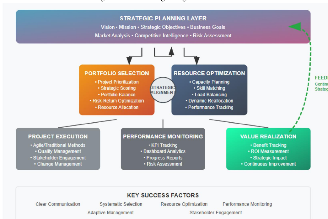
Figure 1: PPM Strategic Alignment Framework

This figure illustrates the interconnected components of strategic alignment in project portfolio management, showing the relationship between strategic planning, portfolio selection, resource allocation, and value realization mechanisms.