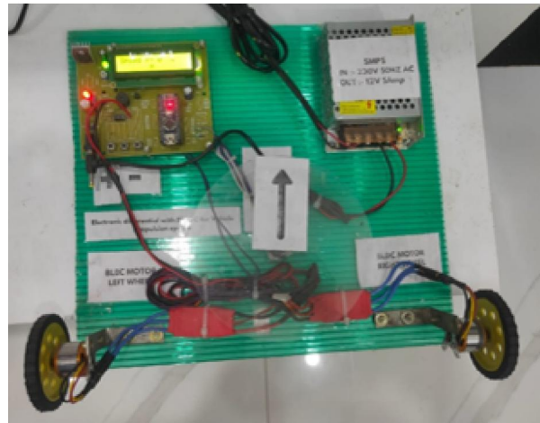
Figure 2: Modal Prototype