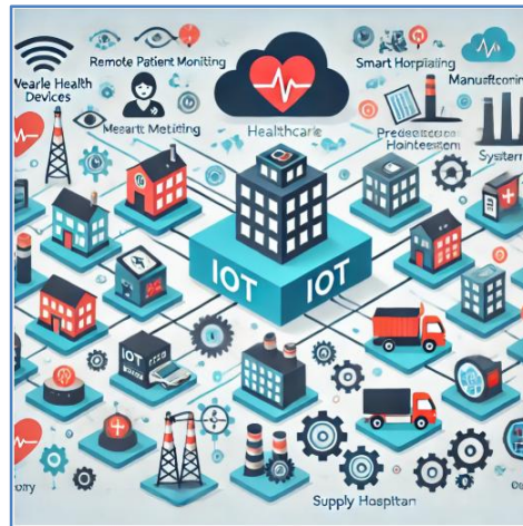
Fig.1 IoT Applications in Healthcare and Industry