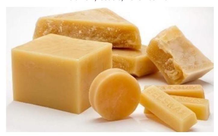
Fig 2: Bees