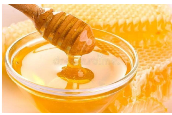
Fig: 6 Honey

Synonyms -madhu, madh, mel, purified honey