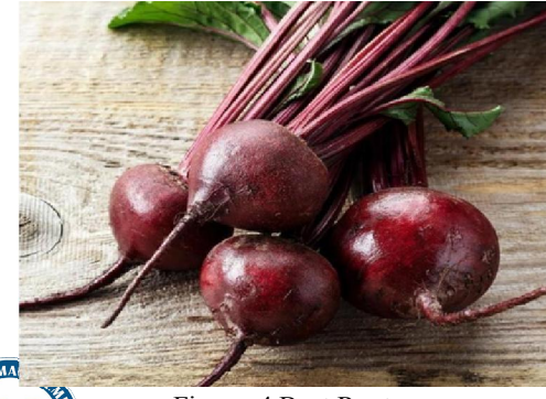
Fig no. 4 Beet Root DOI: 10.48175/568