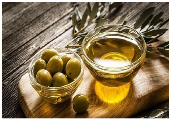
Fig 5: Olive Oil

Synonyms Oleum olivae, Sweet oil, Salad oil.