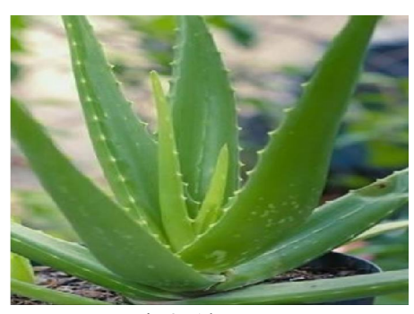
Fig 3: Aloe Vera