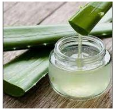
FIG 4: ALOE VERA