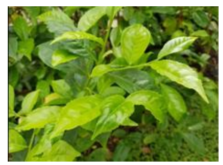
FIG6: GRREN TEA