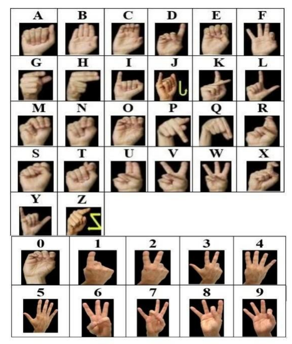
Fig.1. ASL Alphabets and Number gestures

The 19 various hand shapes of ASL are cast-off to make 26 American Manual Alphabets. An identical hand shape with diverse orientations is used for 'K' and 'P' letters signs. In ASL, also offers a set of 10 numeric gestures to sign the numbers '0' to '9'. ASL doesn't comprises built-in ASL equivalents signs for accurate nouns and technical terms [4]. Along with ASL Alphabets and Numbers, there are thousands of hand and facial gesture signs are available to sign the various English words as well. The set of 26 gesture signs of English Alphabets (A-Z) and 10 Numbers (0-9) are shown in Fig. 1