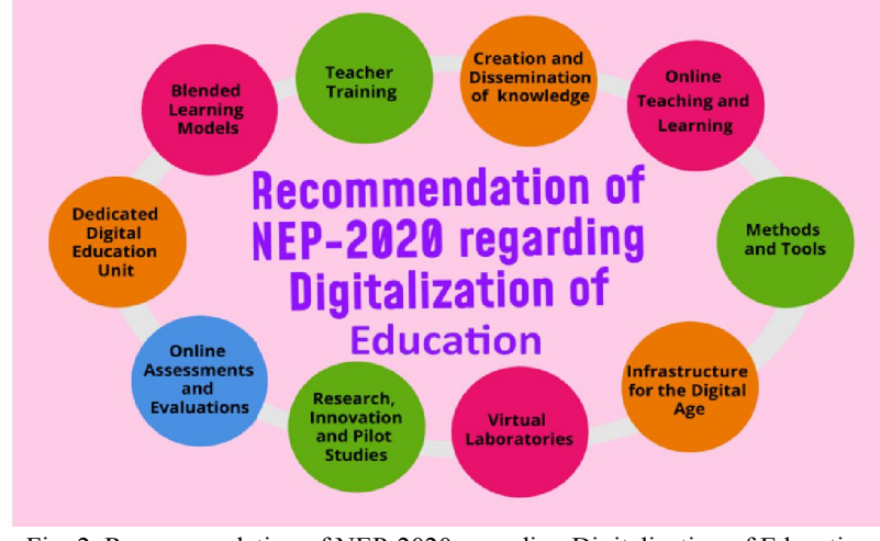
Fig. 2. Recommendation of NEP-2020 regarding Digitalization of Education

technology to improve access, quality, and equity in India's education system. The new education policy recommends the following actions for the digitalization of education: