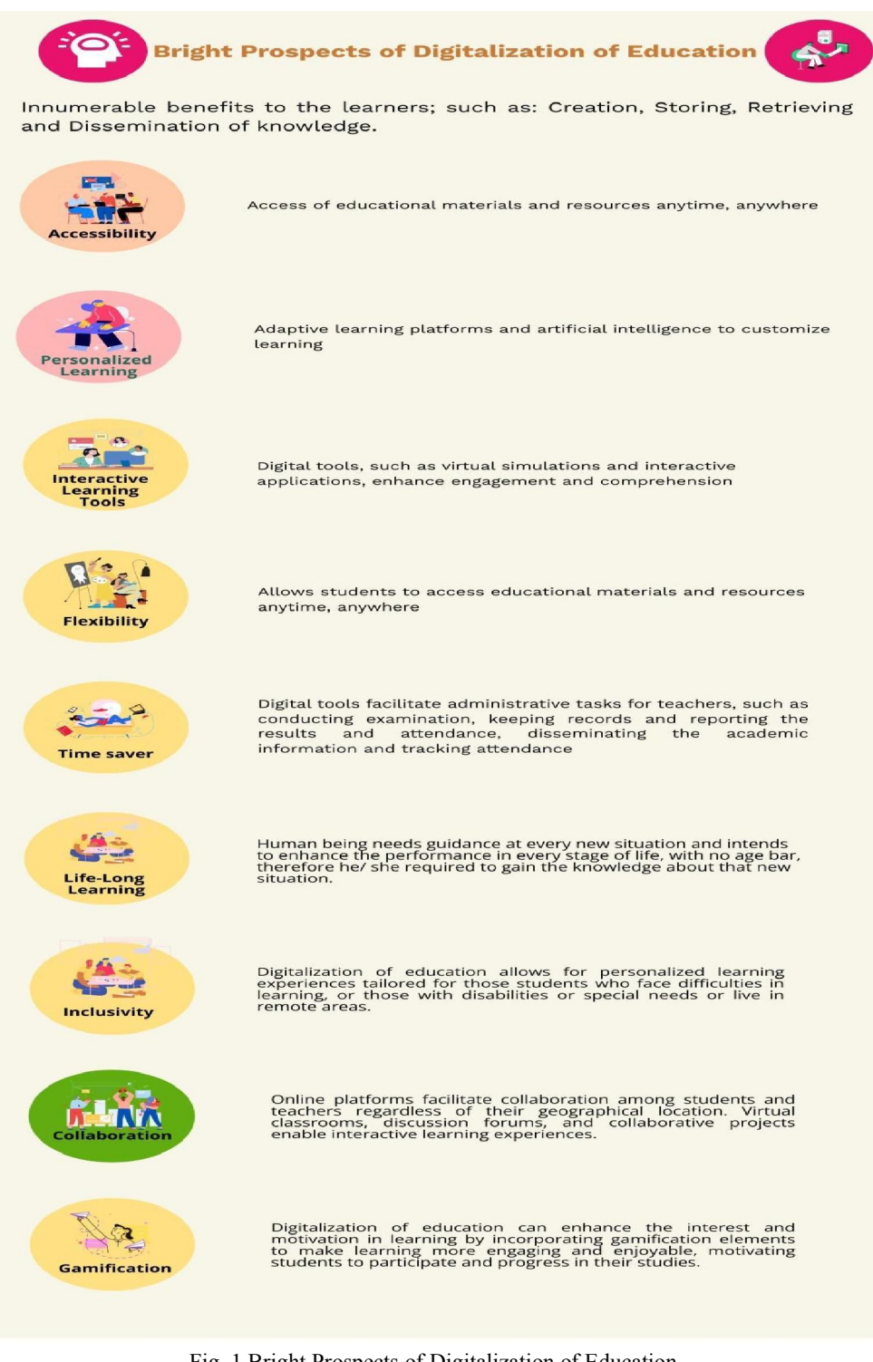
Fig. 1 Bright Prospects of Digitalization of Education