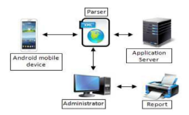
Fig. Attendance System Architecture