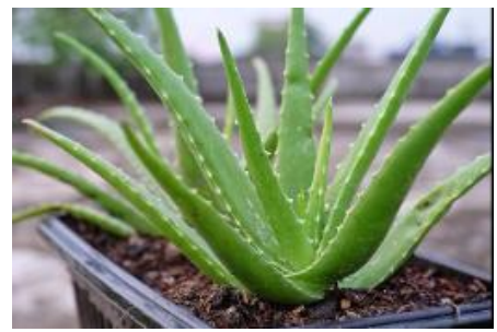
Fig: Aloe Vera Leave DOI: 10.48175/568