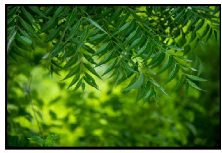
Fig: Neem leaves