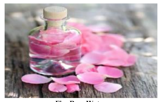
Fig: Rose Water