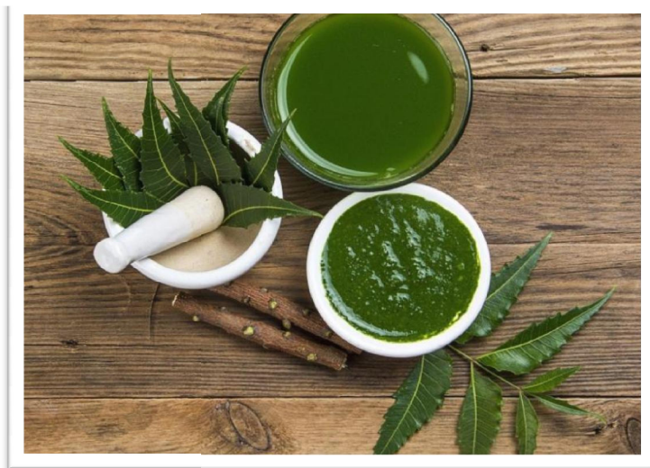
Fig 7. Neem