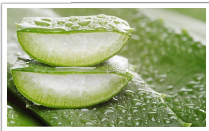
Fig 2. Aloe Vera