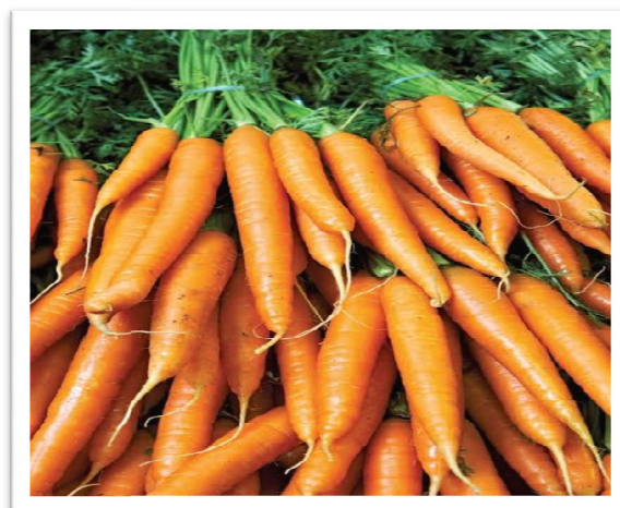
Fig 5. Carrot

Carrot seed oil Is a reestablishing, invigorating, and hostile to maturing Substance. [17,18]