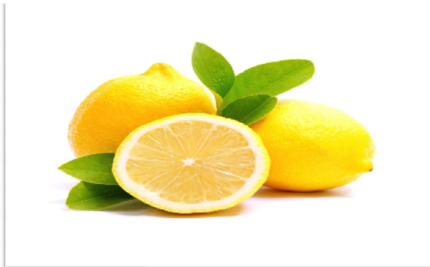
Fig 4. lemon