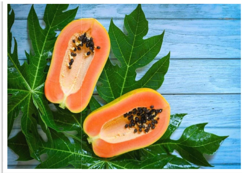
Fig 10. Papaya

Lotions are liquid preparations meant for external use without friction.