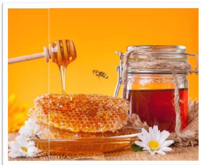
Fig 6. Honey

It minimizes pores, fights bacteria, and keeps your skin smooth and young. [19,20]