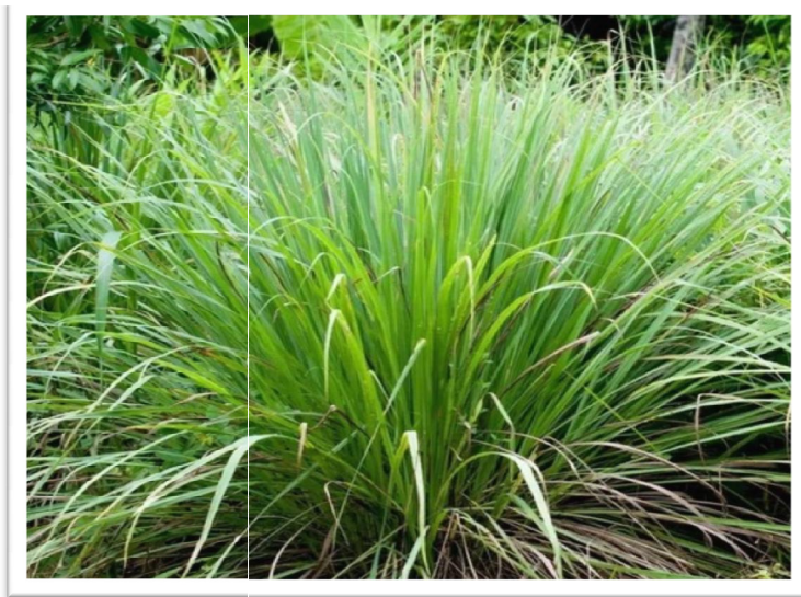
Fig 2. Lemongrass

Lemongrass has the additional aromatherapy benefit of boost your mood and helping you focus throughout the day. [10,11]