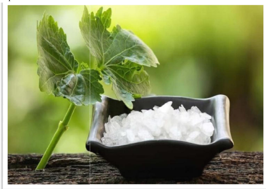
Fig 9. Camphor