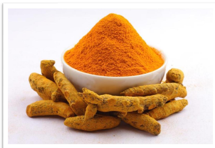
Fig 8. Turmeric