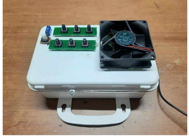
Figure 2 Prototype of the Device

or customizing to special test needs. Considering this factor, the electronic load device serves not only as a technological breakthrough but also by practical advancement in the area of electronic testing and measurement.