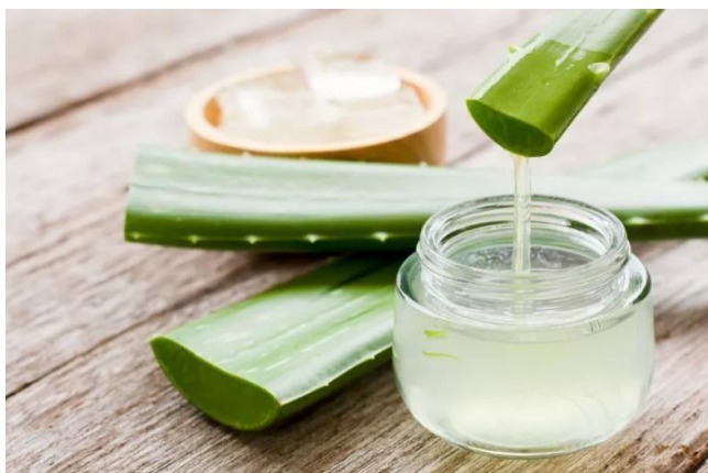
Aloea Vera gel (Aloe Vera):

Besides having anti-inflammatory and antibacterial parcels that help target the source of conditions similar as eczema, turmene may also inhibit the exertion of Ph K, a protein associated with psoriasis. There is no deficit of ways to take advantage of turmeric benefits for skin. As you can see, turmeric can work prodigies for your health and spice up your diurnal skincare routines