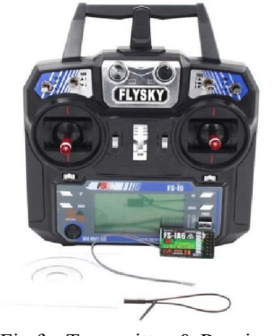
Fig f – Transmitter & Receiver