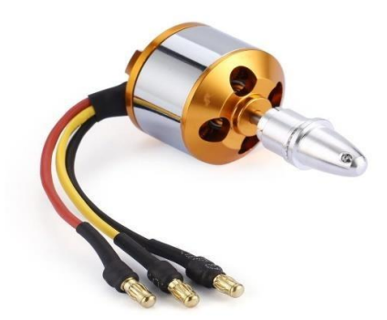
Fig b – BLDC Motor