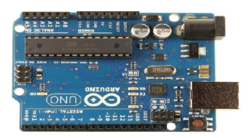
Fig d - Arduino UNO