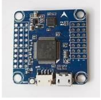
Fig e – Flight Controller F4