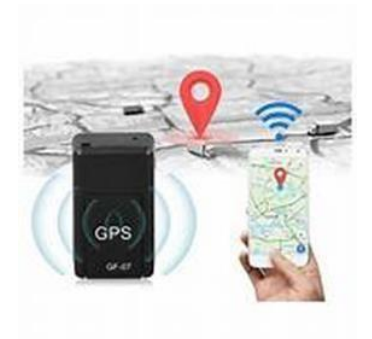
Fig C - GPS tracker

Abbreviation of global positioning system is GPS. GPS is a navigation system with space station in mid earth orbit that transmit microwave signals and help customers determine location, direction, and time GPS is used worldwide for a variety of purposes, including tracking, surveillance, and scientific research. This device enhance the performance of controller