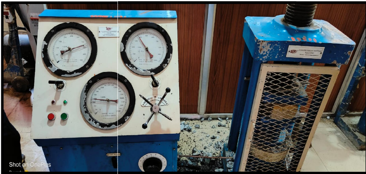
Fig 2. Paving block Testing