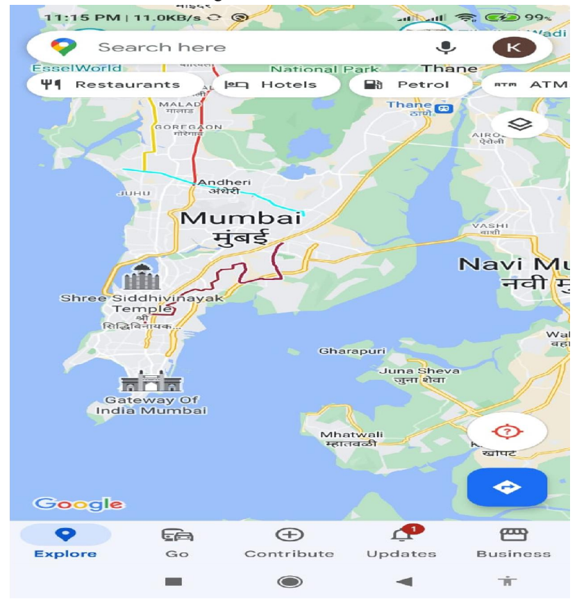
Fig. 4.1 Interface for calculating the user-required places.

We were unable to find the API available free that might give us the information of countries and the state and provinces/state mentioned in them. We did find the database maintained by google containing the accurate list of cities. However this database could not be exported ,we had to manually run SQL script to obtain the data from this database of the city, state/province and country names. A frequent issue was preventing the page from refreshing when the user chose a country to load its associated states and again to load the cities associated with those states