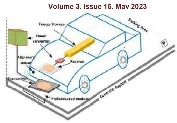
Fig :2 Static wireless ev charging

International Open-Access, Double-Blind, Peer-Reviewed, Refereed, Multidisciplinary Online Journal