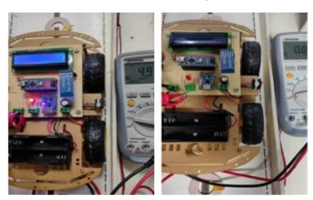
Figure 3: Transferred output voltage and current