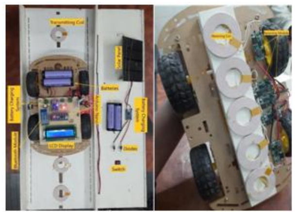
Figure2: Reading of overall output voltage

Security concerns regarding data transmission were also noted, indicating a requirement for improved encryption protocols. In conclusion, while the system demonstrated substantial advancements in efficiency and user convenience through IoT integration, addressing connectivity issues, enhancing predictive maintenance accuracy, and strengthening data security are essential for optimizing overall system